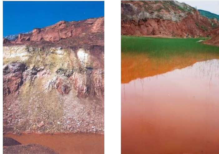
Figure 5. Water accumulation at the base of the quarry in 1995 and 2004 (LORINȚ, 2005)