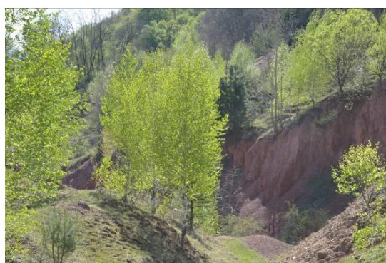
Figure 11. Spontaneously installed birch trees (2020)

Of course, this process of ecological succession also depends on other factors (especially climatic ones) and therefore, we cannot determine a period of time until this replacement will be completed.