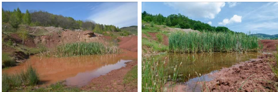
Figure 6. Water accumulation at the base of the quarry in 2017 and 2020