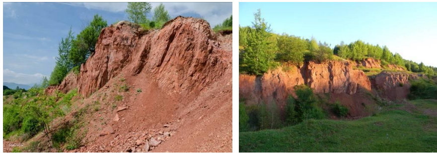
Figure 8. Modeling through erosion of the quarry's steps (2020)

However, we appreciate that the erosion processes have a positive influence on the landscape by the fact that this phenomenon leads to the modeling of the initial geometry of the quarry's steps, to forms closer to those naturally present in the nearby areas (Figure 8).