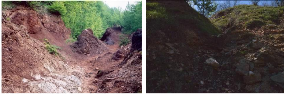
Figure 7. The intensity of erosive phenomena throughout the year 2004, respective 2020

large ravines (which in turn favored the formation of torrents and endangering the few households downstream of the quarry), in the last interval of studied time it is found that these phenomena have decreased in intensity (Figure 7 right), being similar to the processes present in nearby areas, which are not affected by human activities.