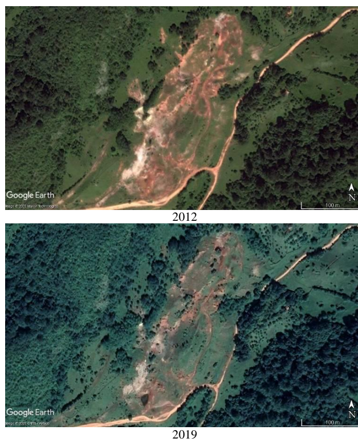
Figure 2. Satellite images with the area of the former quarry Ohaba - Ponor, Comarnic - Poieni sector

Satellite images are a very good tool to assess how a territory (landscape) evolves over time (HERBEI ET AL., 2015). Thus, in order to get an overview of how the landscape evolves in the studied area, we compared two satellite photos, from June 2012 and June 2019 (Figure 2).