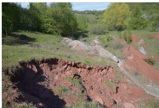
Figure 10. Active landscape modeling phenomena (landslides in 2020)

Also in the area of the interior dump there were identified active phenomena of landscape modeling such as landslides (Figure 10). These landslides are small in size, do not extend deep and involve relatively small volumes of material.