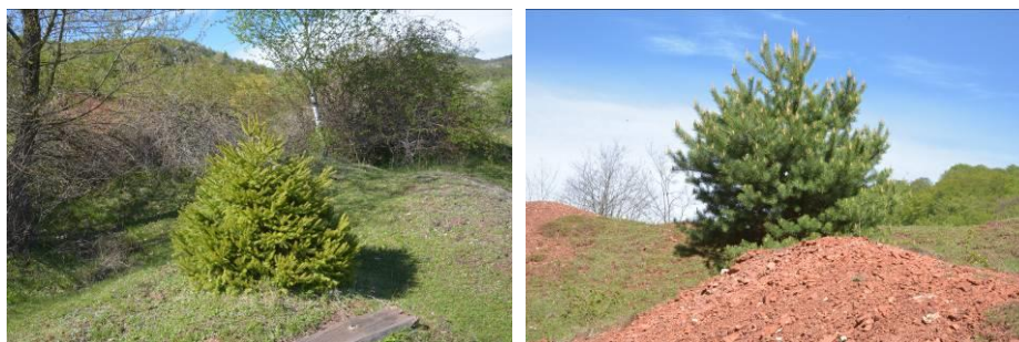
Figure 12. Spruce and pine trees installed spontaneously (2020)

Another interesting aspect related to the vegetation installed spontaneously in the studied perimeter is related to the appearance of some species characteristic of a higher bioclimatic floor, namely spruce ( Picea abies ) and pine ( Pinus sp. ) (Figure 12).