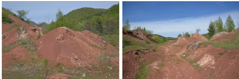
Figure 9. Interior waste dump, geometrized and devoid of vegetation (2020)

In the studied perimeter there are another series of elements which are identified with anthropic activities, such as the deposition cones of the material from the overburden (Figure 9). These elements appear in the area where the sterile rocks resulting from the exploitation activity were stored, more precisely the altered mineral part (VESA, 2020).