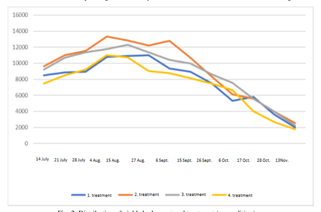
Fig. 2. Distribution of yields by harvest and treatment (own editing)

The fourth treatment harvested the lowest yield, with a total of 95446g harvested from the four replicates. Here we see an increasing trend until the beginning of August. The highest quantities in this treatment were recorded on 4 and 15 August, 10997g and 10756g respectively. From 27 August onwards the yield reduction was steady and small. A significant reduction was observed in the last three pickings. The total yield measured at the last harvest was 1784g.