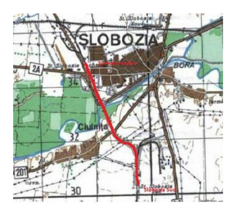
Fig.2 SloboziaSud-SloboziaVecheKM 12+814-16+258 section map

The old plans obtained from the CFR Regional helped us delimitate easier the land in CFR's possession, the safety limit which is 100 meters away from the road axis and the protection limit which is 50 meters away from the axis (Fig. 6, 7).