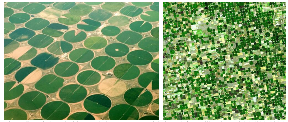
Fig. 6. Crops irrigated with central pivot systems (aerial view - left; satellite view - right) (***, 2021)

The CPI (or water wheel irrigation, or circular irrigation), as a method of irrigating farmlands, involves the use of rotary equipments, while the crops are effectively watered by different types of sprinklers. The irrigated area by CPI systems creates, often, a circular pattern in crops when observed from above (Figure 6) (named crop circles that must not be confused with those resulting by the circular flattening of crop portions).