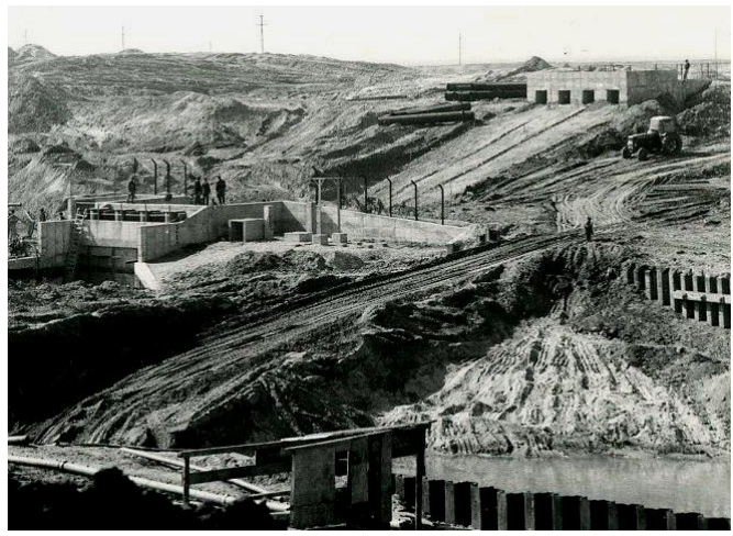
Fig. 3. Bechet-Corabia irrigation system site in 1972 (***, 2019)

The work was carried out by British companies with special backhoe loaders between 1969 and 1972 (Figure 3), being completed by a massive operation of planting a network of protective vegetation curtains.