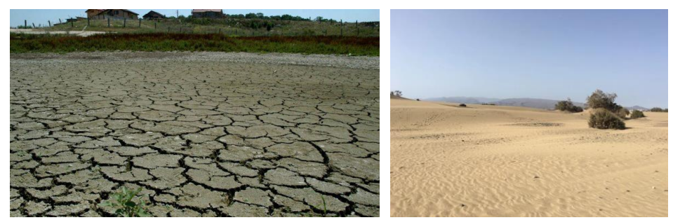
Fig. 4. The aspect of the lands from the south-west of Dolj County

Of course, in these conditions, ie in the absence of irrigation systems, given the intensive practice of agriculture, climate change has become even more extreme in recent years (decreasing rainfall or going through periods of extreme drought, rising temperatures, intensifying winds etc.) or in other words of a faulty way of land management, they lost their ability to support the vegetation (agricultural crops, orchids or vine cultivation) and gradually turned into desert (Figure 4) (JURJ, 2018).