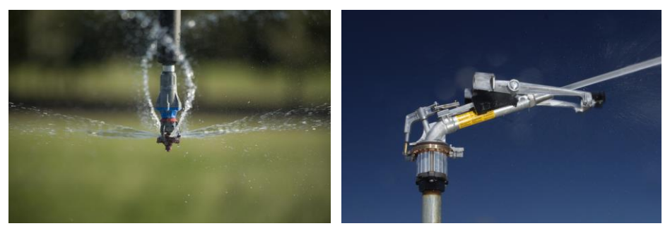
Fig. 7. Types of nozzles used for central pivot irrigation systems (***, 2021)

Upstream of each nozzle pressure regulators are usually installed (Figure 7). These regulators ensure that every nozzle operates at the designed (recommended) pressure.