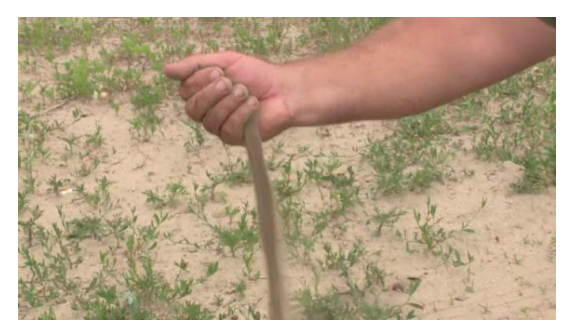
Fig. 1. Transformation of agricultural lands in Dolj County into a desert

restoration of the ecosystem existing before the start of intensive agricultural activity but rather to restore its quality and support capacity of agricultural crops.