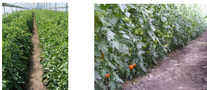
Figure 2: Foliar fertilizers influence on tomato in solar (Izmir cultivar) irrigation by dripping

Table 4 is shown the influence of foliar fertilization on the assimilating pigment content in fresh leaves of tomato into the field, harvested on 10 days after foliar application of the last treatment. Thus, by foliar fertilization increases both assimilation pigment content of each part, and the total assimilatory pigments content (from 36.02% - Accele-GRO-M - 0.1% to 46.27% - Nutrivant Plus Tomato - 1%).