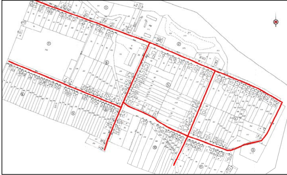
Figure 3. Traverse sketch

The data processing has been made by post processing software using specific software -TOPOSYS, AUTOCAD.