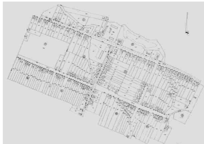
Figure 2. Jena commune